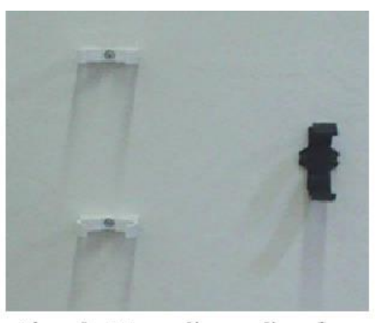
Fig. 4 Mounting clips for system & permeate pump