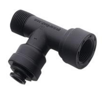
Fig. 2 EZ adapter