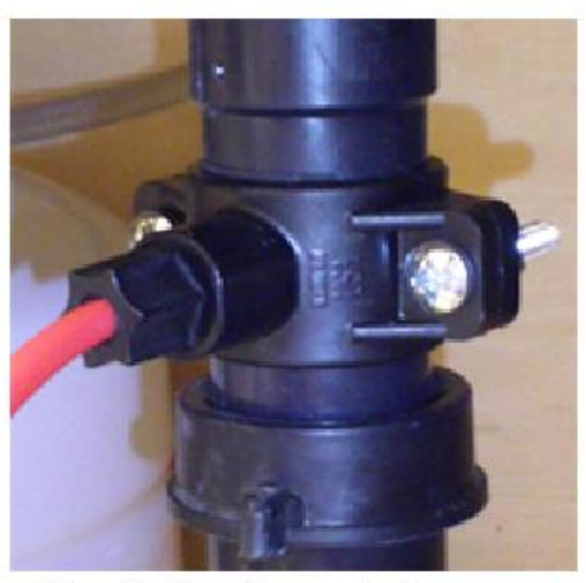
Fig. 5 Drain saddle