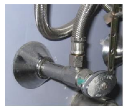
Fig. 1 Angle stop